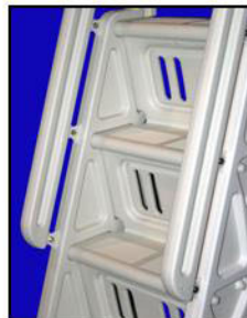
DOUBLE HANDRAILS FOR EASY CLIMBING