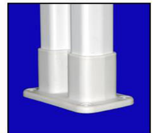
ADJUSTABLE DECK FLANGES FOR IN-POOL