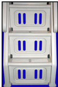
FLOW-THROUGH ANTI-ENTRAPMENT TREAD RISERS