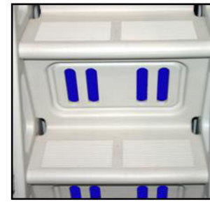
LARGE, ANTI-SKID TREAD SURFACES (7½" x 16½")