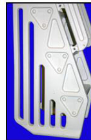
FLOW-THROUGH ANTI-ENTRAPMENT SIDE FRAMES