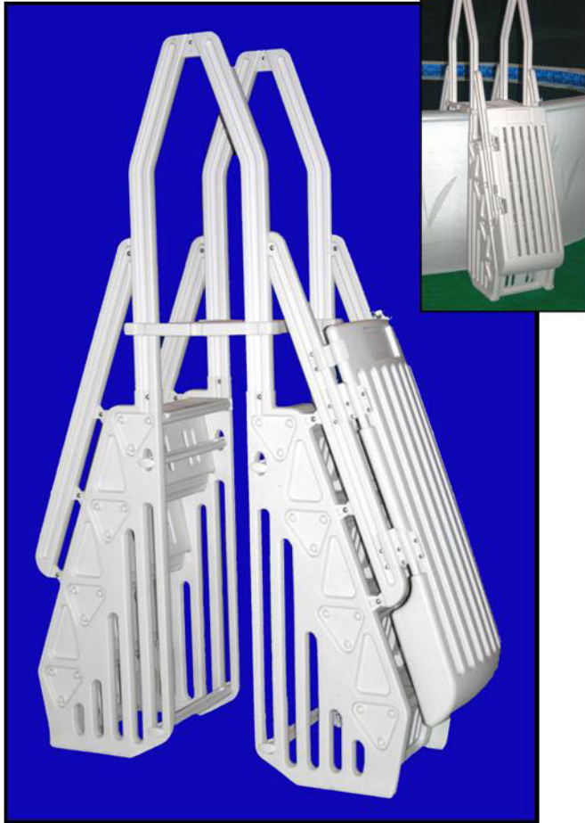
MODEL 2006AF DELUXE A-FRAME STEP~LADDER