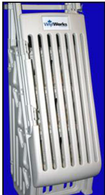
COMPLETE PROTECTION WITH GATE